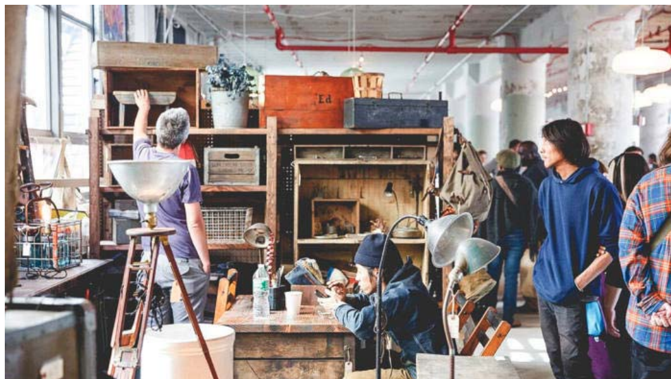
Brooklyn Flea at Industry City

In the complex, visitors enjoy artisanal coffee from the Extraction Lab, which comes in at a scalding $18 a cup; sample $15 avocado burgers from Avocaderia — “the world’s first avocado bar”; and peer through the glass at the tantalising production line of Li-Lac, New York’s oldest chocolatier’s latest outlet. A cavernous table-tennis gymnasium and a crazy golf course offer ample opportunities to relax.